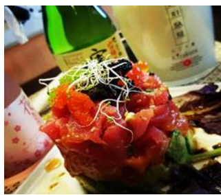
tuna tar tare.