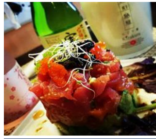
tuna tar tare.